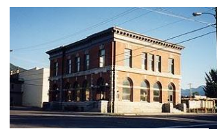
Fernie Heritage Library